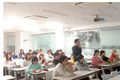
A scene from the orientation