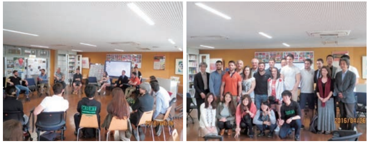
Scenes from young people's interchange between France and Japan