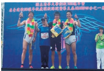
Students of UT won in the AEARU Student Athletic Competition.