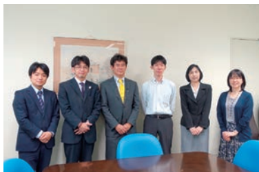
A party of Senior High School at Sakado visited Interchange Association