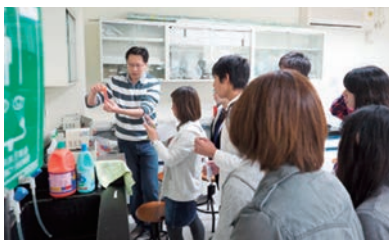
Preparing for cell culture

On the last day of the visit, they studied the method of scientific presentations by presenting their results. During their stay, they visited National Museum of Natural Science, a biotechnology company, an institute for Chinese tea, a factory for wood utilization training, and Chiufen. A number of faculty staff and students of NTU participated in this course, so our students had great opportunities to learn not only how to communicate in English, but also the culture, companies, nature, science in Taiwan, and to think about their own future. This field is expected to be used by GIP-TRIAD.