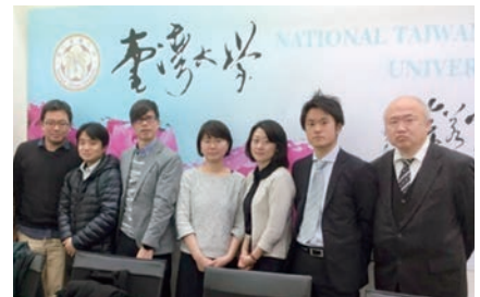
Participants of the meeting