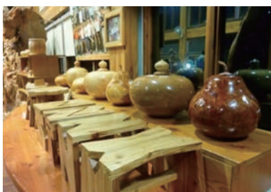
Wood Products Museum