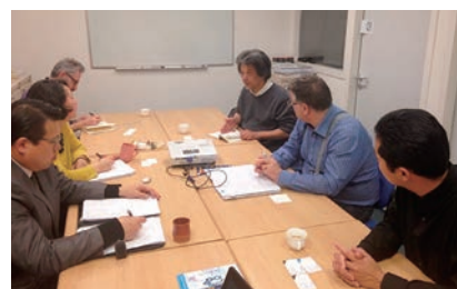
Meeting at Bordeaux Office