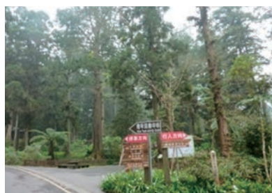
Landscape Zone in Xitou