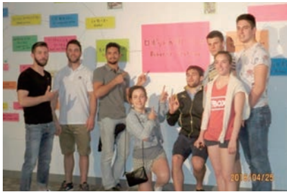
A scene from the tour