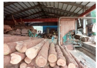
Wood Processing Facility