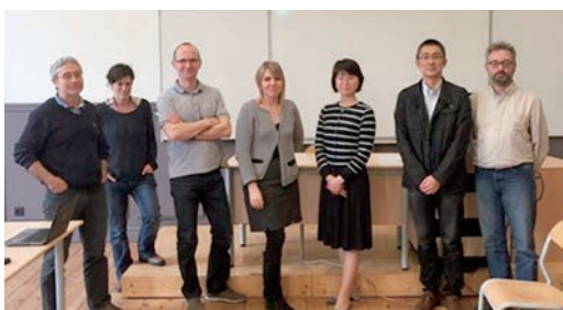
Commemorative photo of the meeting on establishing Jukebox system in University of Bordeaux