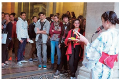
The Introduction of Japanese culture by the organizer

On April 29, A Soirée was held on Victoire campus in University of Bordeaux to introduce Japanese culture. This event was planned by Japanese students studying in UB including students from UT. They worked very hard to prepare Japanese meal from the previous day, and they had a booth for visitors to try the tea ceremony and writing kanji. There was also a corner for raising funds for the disaster by Kumamoto earthquakes and for visitor participation-type events. The Sinobue and Shamisen was played by Japanese students and Yosakoi dance was performed by an external invited organization, both of which everyone was excited about. Japanese pop culture is popular in France and many people are interested in our culture, which led about 150 people to this Soirée. This event must have attracted more interests in Japanese culture from visitors.