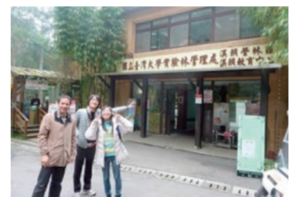
Office of Experimental Forest