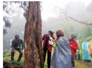
Outdoor experience in the forest of NTU

For 10 days from March 10 to 19, ten students of Medical Science experienced practical and laboratory exercises for the purpose of “applying its unique biological resources in Taiwan to medical science”. Taiwan is in its tropical and subtropical areas, having unique climate, with many mountains that are over 3000m tall, so they focused on the research capability of NTU, its bioresources, and the Chinese traditional medicine. Those exercises included field works in the forest of NTU, studying Taiwan’s distinct biodiversity, and exploring the bio-resources used for health and medical purposes. In the laboratory in NTU, they identified the biological samples that they had collected, and performed a component analyses of the extraction liquid and medical analyses of the effect on cancer cells and active oxygen.