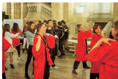
Yosakoi performance by an invited team