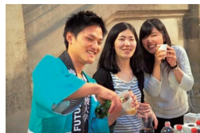
A scene from the Soirée