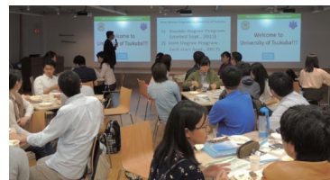
Top: NTU and UT DDP students (at the UT Global Village Community Station) Bottom: Introducing DDP and GIP-TRIAD