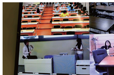
Scenes from distance learning courses

In the 2017 academic year too, this distance learning course began (among UT, NTU and KU). This course is compulsory for NTU GIP-TRIAD students.