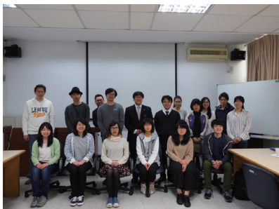
Left: Group photo.