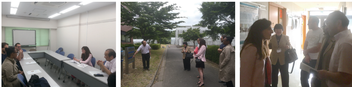
Left: Meeting with UB students. Center & right: Viewing the T-PIRC facilities.