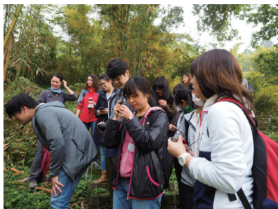
Center: Conducting field work.