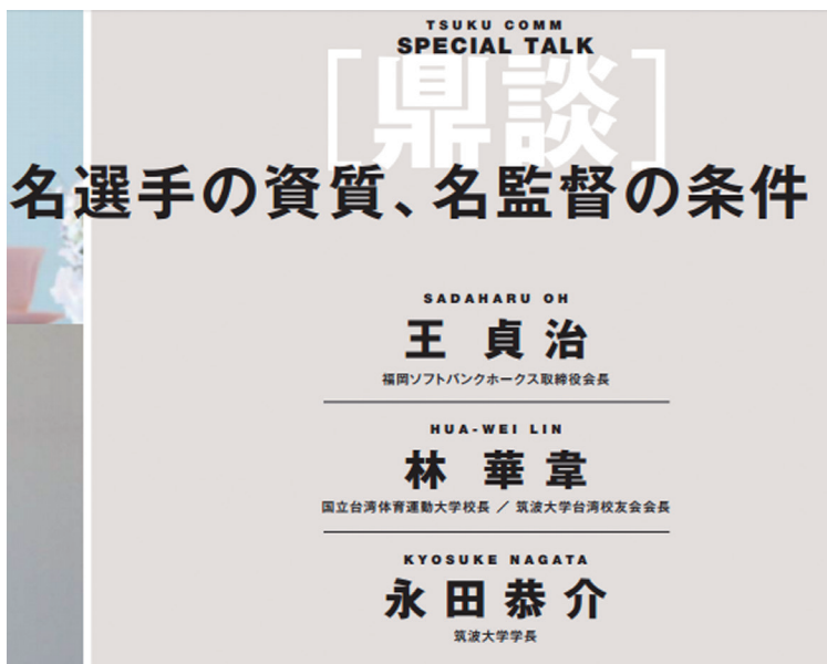
Special Talk Article