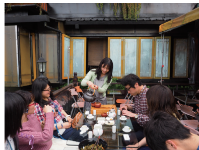
Right: Cultural experience (Taiwanese tea).