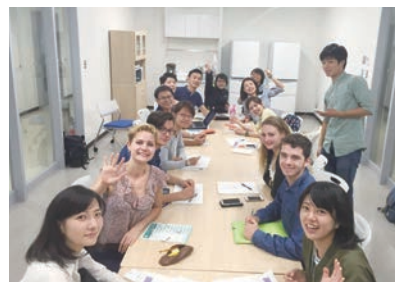
Left, Center: Arrival of GIP-TRIAD students Right: Meeting between tutors and GIP-TRIAD students

We held an initiation seminar over three days from September 11, with an orientation, self-introductions, social gatherings and group work aimed at enabling both faculty and students to get to know one another better and cultivating friendships. On September 14 and 15, we held excursions to aim of deepening students' understanding of food security and food safety. With the cooperation of Toyo Energy Farm CO., LTD., we visited and toured a lettuce hydroponic cultivation facility and a solar-sharing farming type power generation facility. Then, on the afternoon of September 14, we visited Tsukuba City's "Tsukuba Agriculture Research Hall", and students were briefed by an expert guide on initiatives and results related to "Food & Agriculture" at Japanese research institutes. This fieldwork was a good opportunity to relieve the student's nerves as well as to share thinking and cultural differences among the students from the three universities. From September 19, the students divided into three groups and began preparations for their papers and presentations for student presentations for TGSW2017 on issues related to Food & Health and solutions to resolve them.