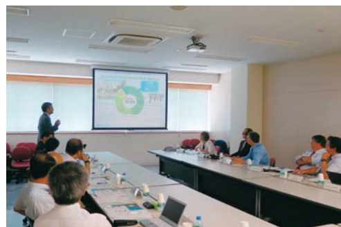
Meeting with our life and environmental sciences senior staff