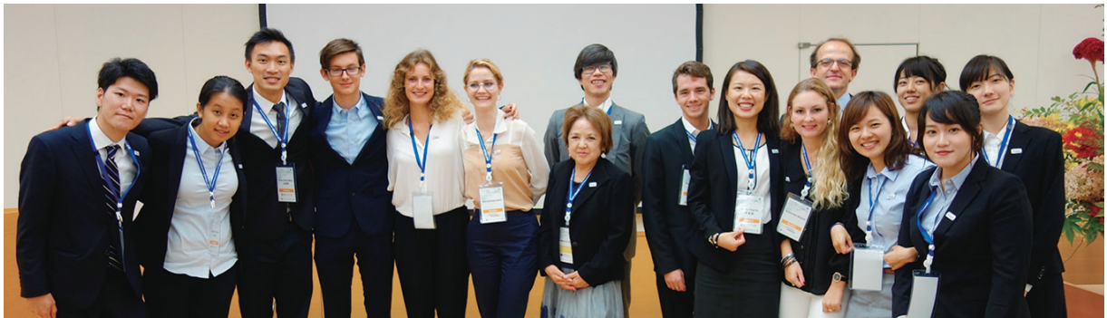
Group photo after student session in TGSW2017