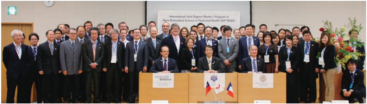
Commemoration Ceremony at the Kick-off Symposium for the TGSW2017 International Joint Degree Master's Program in Agro-Biomedical Science in Food and Health