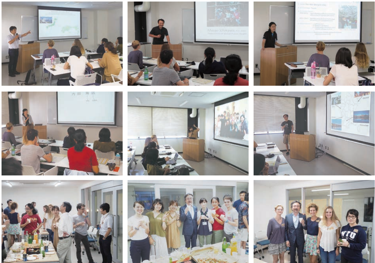
Upper & middle: Scenes from self introduction in GIP-TRIAD initiation seminar Lower: Scenes from welcome party for GIP-TRIAD students