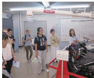
Tour of Tsukuba Agriculture Research Hall