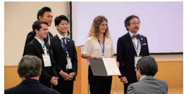
Student session at the Kick-off Symposium for the TGSW2017 International Joint Degree Master's Program in Agro-Biomedical Science in Food and Health