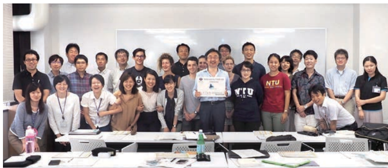
Group photo in GIP-TRIAD initiation seminar

We held an initiation seminar over three days from September 11, with an orientation, self-introductions, social gatherings and group work aimed at enabling both faculty and students to get to know one another better and cultivating friendships. On September 14 and 15, we held excursions to aim of deepening students' understanding of food security and food safety. With the cooperation of Toyo Energy Farm CO., LTD., we visited and toured a lettuce hydroponic cultivation facility and a solar-sharing farming type power generation facility. Then, on the afternoon of September 14, we visited Tsukuba City's "Tsukuba Agriculture Research Hall", and students were briefed by an expert guide on initiatives and results related to "Food & Agriculture" at Japanese research institutes. This fieldwork was a good opportunity to relieve the student's nerves as well as to share thinking and cultural differences among the students from the three universities. From September 19, the students divided into three groups and began preparations for their papers and presentations for student presentations for TGSW2017 on issues related to Food & Health and solutions to resolve them.