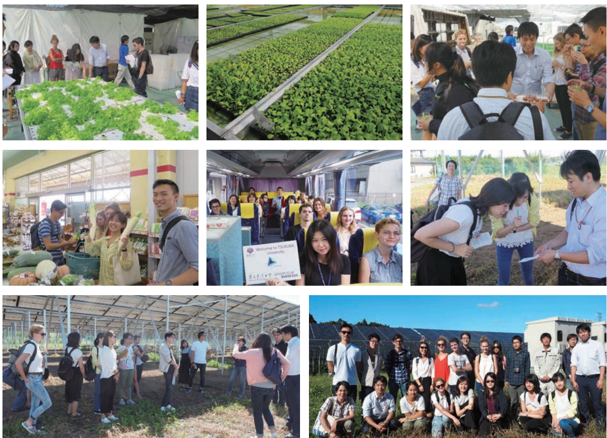
Tour of Hydroponic lettuce culture and Solar-sharing farm in TOYO Energy Farm CO., LTD.