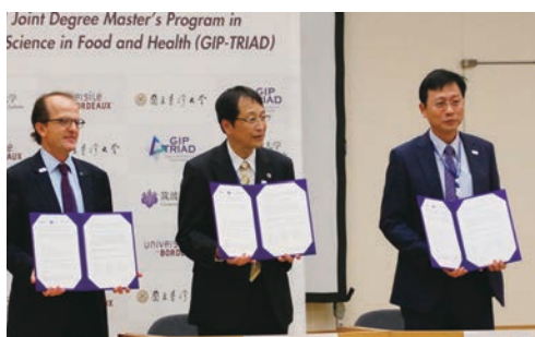
Commemoration Ceremony at the Kick-off Symposium for the TGSW2017 International Joint Degree Master's Program in Agro-Biomedical Science in Food and Health